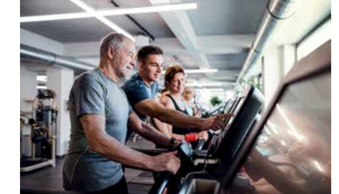
Next door you'll also find the convenient David Lloyd Club, the fitness destination for the whole family, with a variety of facilities including swimming pools and kids club to keep you all entertained.