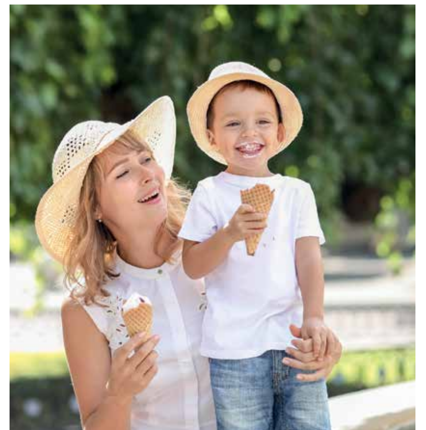
The local amenities and nearby schools make Millers Walk a family friendly development with nearby Hedge End offering plenty of retail and leisure opportunities.

WEST END IS FULL OF MODERN CONVENIENCES YET STILL RETAINS THAT CHARMING VILLAGE FEEL. TRULY A DESIRABLE LOCATION.