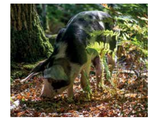
Where will your next adventure take you?